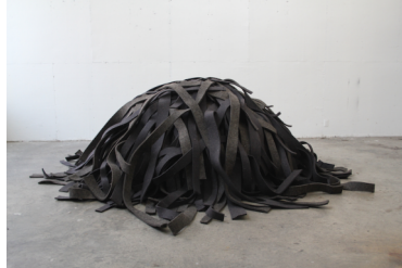
Breather , 2013