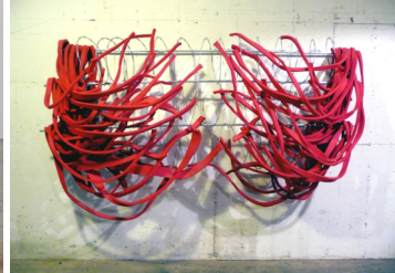
Red Razor II , 2013