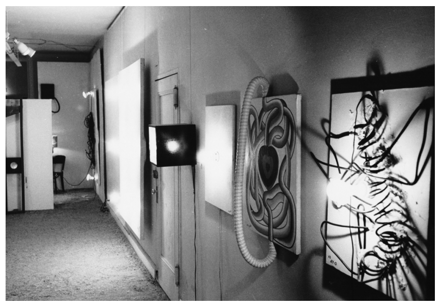
Installation view of Boxing Match, 1963, showing works by Ay-O

Although many of the sculptures from the original exhibition have since been destroyed, 1963 – Boxing Match, Revisited will include works by all four artists dating from the 1960s, which exemplify each artist's distinct set of aesthetic concerns during this period. These pieces will be shown alongside photographs and ephemera related to the 1963 exhibition. Through this presentation, Boxing Match, Revisited aims to excavate this all but forgotten moment in postwar art history, bringing attention to its significance as the first exhibition of Robert Morris' Minimal works as well as a precedent for the seminal Boxes exhibition held in 1964 at the Dwan Gallery in Los Angeles. Perhaps most importantly, the show highlights the creative exchanges taking place between American and Japanese avant-garde art groups during the 60's, which were integral to the developments of movements such as Pop, Minimalism, Fluxus, and Conceptual Art.